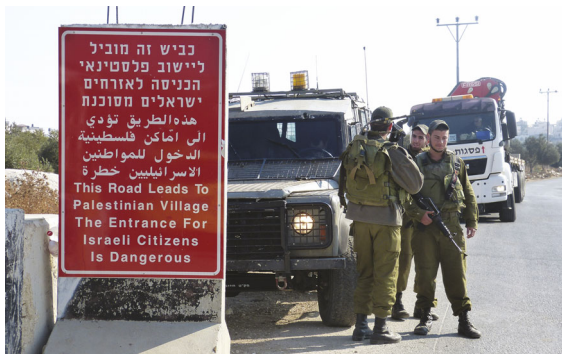
A sign for settlers heading into the rest of the West Bank.