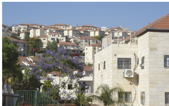
Beitar Illit, the largest city in Gush Etzion.

"It's not well-covered by the press because it runs counter to the stereotype, and it hurts that this message isn't getting out there."